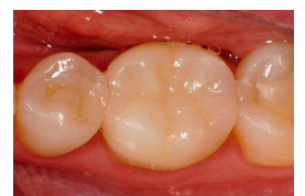
Silver fillings replaced by porcelain inlays/onlays