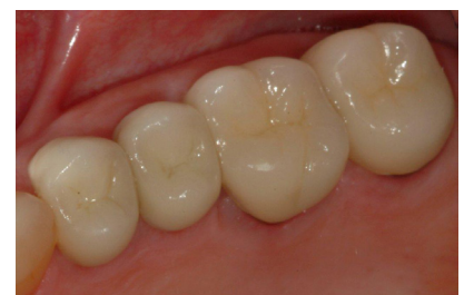
Porcelain fused to metal crowns build back natural tooth appearance and function