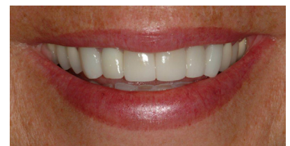
Porcelain crowns build back smile