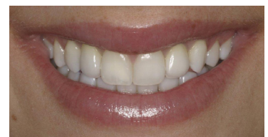
Build back your smile