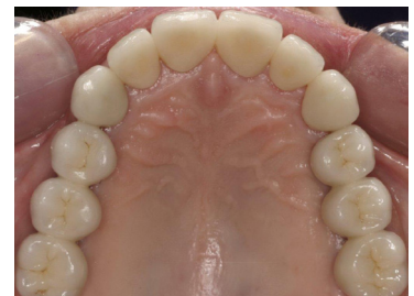
Build back your bite