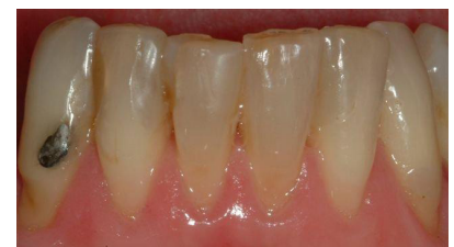
Examples of silver fillings