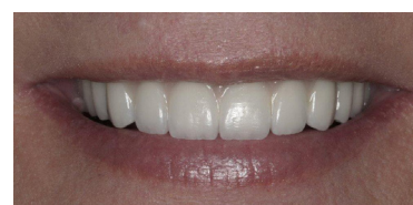
Builds back smile