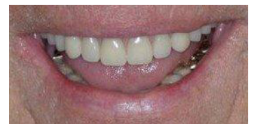
Restores smile and function